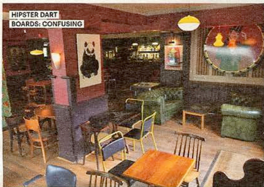
HIPSTER DART BOARDS: CONFUSING

TAKING YOUR TASTEBUDS ON A JOURNEY TO FLAVOUR COUNTRY