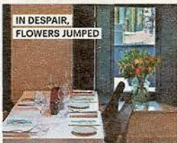
IN DESPAIR, FLOWERS JUMPED