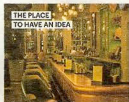
THE PLACE TO HAVE AN IDEA

Located in the new Trinity Centre, The Alchemist provides an unusual experience via its lab equipment. Cocktails are inventive, and the hot Japanese chicken ramen (£9.95) arrived shrouded in a liquid nitrogen mist. thealchemist.uk.com